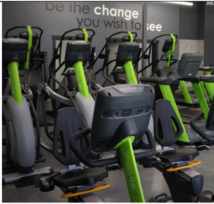
FITNESS1440 ERIE, CO